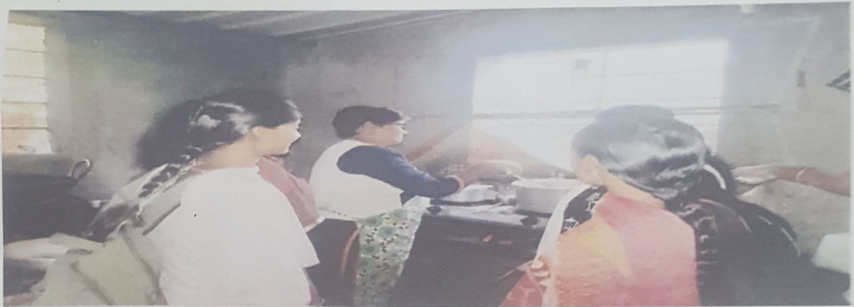
Practical at college canteen