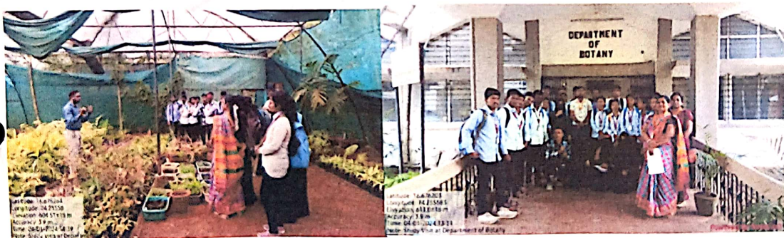
Visit of B. Sc. I & III Year Students to Lead of Botanical Garden Shivaji University