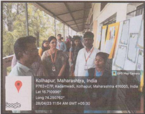
Judges Examining Wallpapers