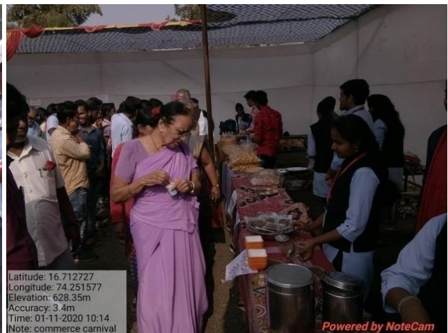
Stalls of various variety products