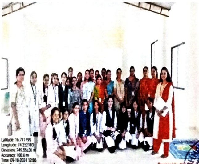
Latitude: 16.711796 Longitude: 74.252193 Elevation: 749.55136 m Accuracy: 100.0 m Time: 09-18-2024 12:06