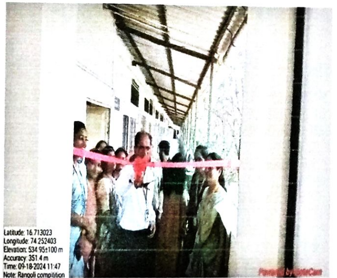
Latitude: 16.713023 Longitude: 74.252403 Elevation: 534.951100 m Accuracy: 351.4 m Time: 09-18-2024 11:47 Note: Rangoli competition