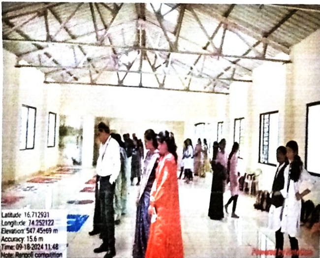
Latitude: 16.712921 Longitude: 74.252122 Elevation: 547.45469 m Accuracy: 15.6 m Time: 09-18-2024 11:48 Note: Rangoli competition