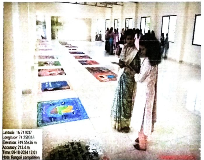
Latitude: 16.711007 Longitude: 74.250365 Elevation: 749.55136 m Accuracy: 213.4 m Time: 09-18-2024 12:01 Note: Rangoli competition