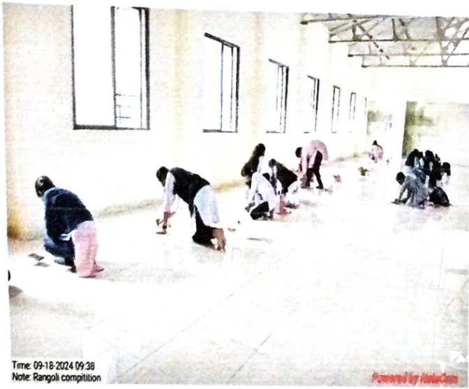
Time: 09-18-2024 09:38 Note: Rangoli competition