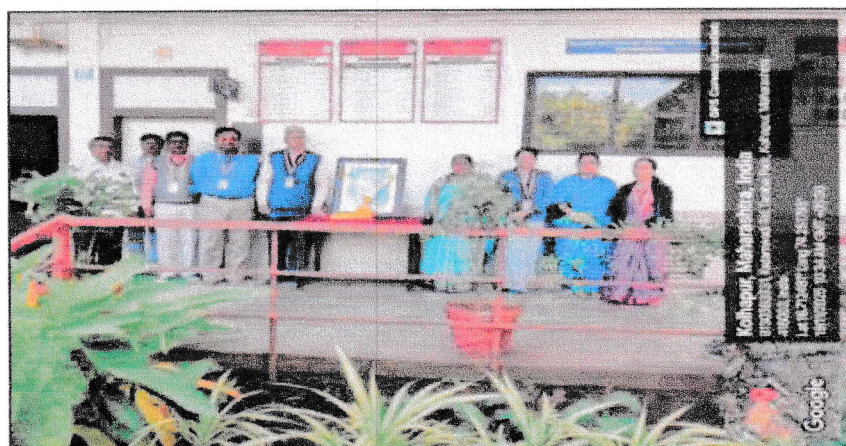
Photo: Celebration of Birth anniversary of Indira Gandhi

Outcome: 1. Cultural values were inculcated among students 2. Students inspires by thoughts and life of great Indian leaders