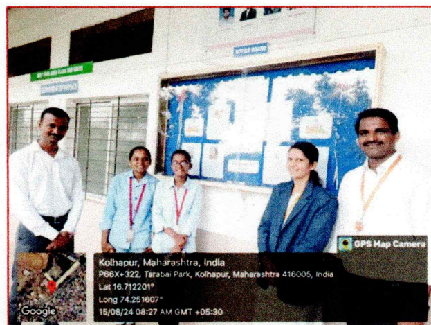
Faculty members and students of Department of Physics