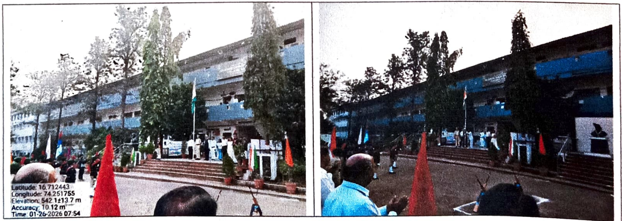
PHOTO GALLERY - REPUBLIC DAY CELEBRATION