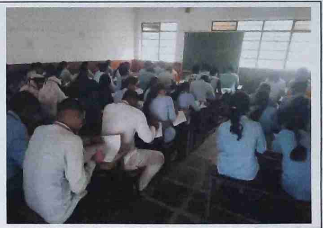
Participants Students and Teachers during the Ozone Day programme.