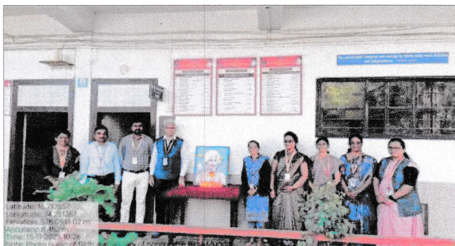
Photo: Celebration of Birth anniversary of Birsa Munda

Outcome: 1. Cultural values were inculcated among students 2. Students inspired by thoughts and life of great Indian leaders