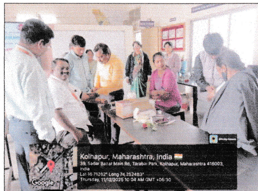
Photo: Team of Sharada Pathology Laboratory Collecting the Blood Samples