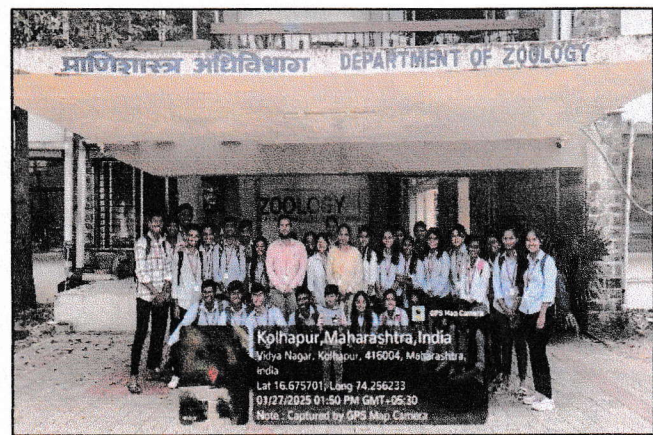
Photo: Visit to Zoology Department