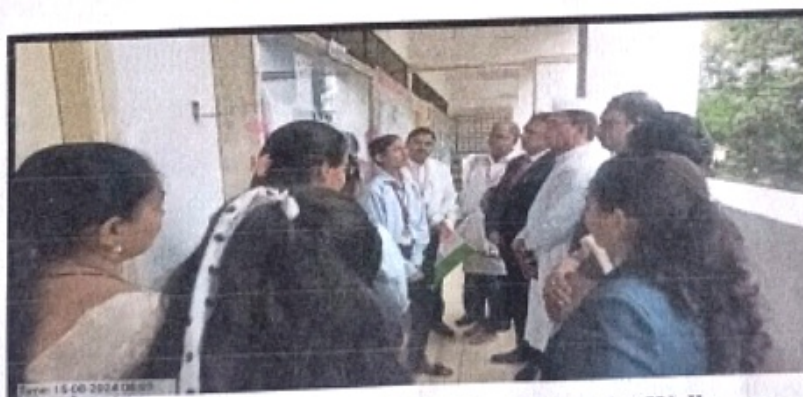
All the Dignitaries and Staff Member Present for Wallpaper