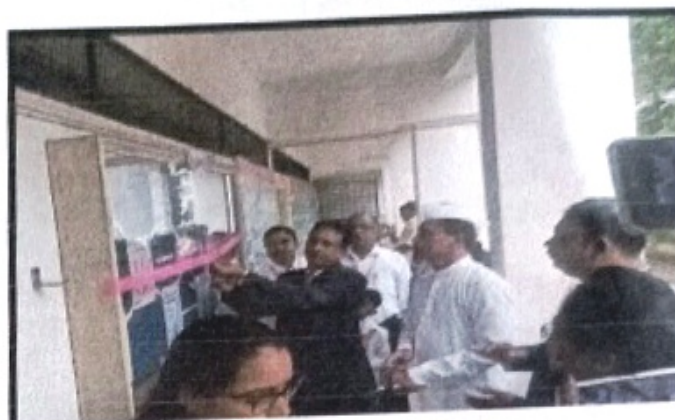
Inauguration of Wallpaper