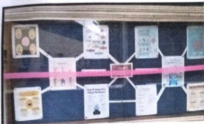
Wallpaper on theme Happy Brain Chemicals"