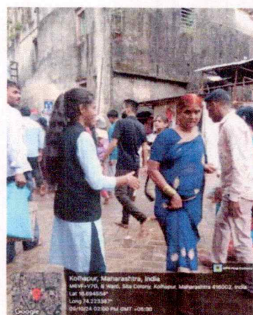
Volunteers performing duties at Bhavani Mandap and Mahalaxmi Temple