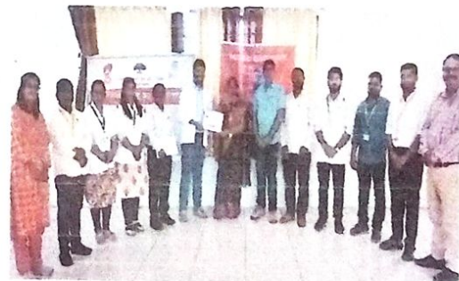
Getting the certificate after the camp