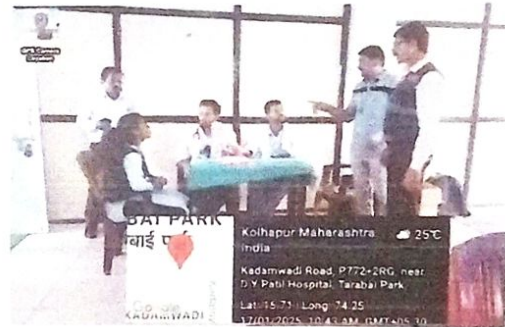
Screening of the donors by doctor's team