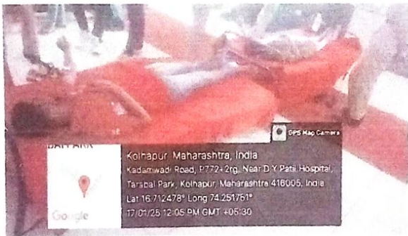
College students Donating Blood