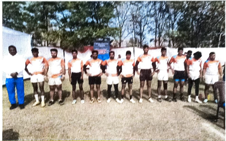
PHOTO - ALL INDIA INTER UNIVERSITY RUGBY (MEN - TEAM) CHAMPIONSHIP.