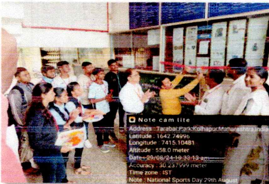
Inauguration of Wallpaper-'Kridavrutta'